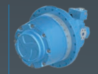
Spicer™ Track Drives CTU 3200