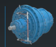
Brevini™ Winch Drive SLW Series