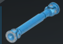
GWB™ Industrial Driveshafts